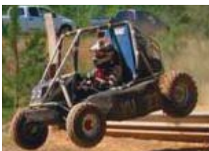
Endurance Race. Villanova placed 24th of 66 teams.