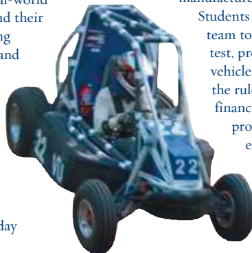
Suspension and Traction Event

Students must function as a team to not only design, build, test, promote, and race a vehicle within the limits of the rules, but also to generate financial support for their project and manage their educational priorities.