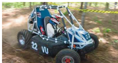
Land Maneuverability Event