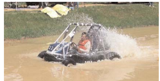
Water Maneuverability Event. Villanova placed 2nd.